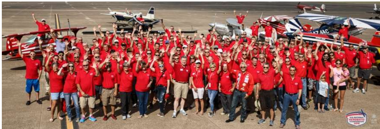
IAC members and Nationals participants gather for the camera in September 2016

The contest is undergoing continuous upgrades with communications one of the biggest improvements being communications this year with officials, volunteers, and competitors through the use of Facebook and Twitter.