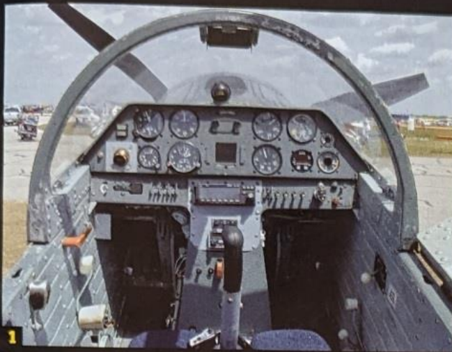
1. Front cockpit.